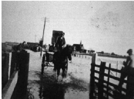
Above: Top of Rye Harbour Road in 1930