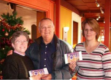
Month's Winners & Answers